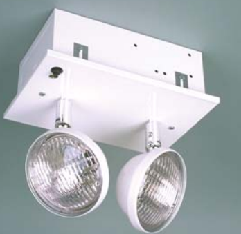
Round Heads Suffix "-R"