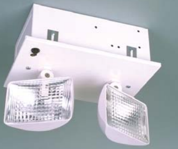
Rectangular Heads Suffix "-PH"