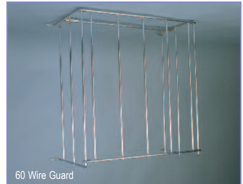
60 Wire Guard

For use with Emergency Lights, Exit Signs and Remote Heads to provide protection from accidental damage. Used in schools, gyms and high-traffic areas. Wire Guards are made of 1/8"-1/4" rod steel. Nos. 60, 61, 62, 63, 64, 66 and 67 have a chrome powder-coat finish.