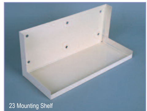
23 Mounting Shelf