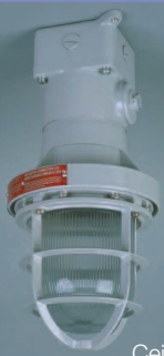
Ceiling Mount (-C)