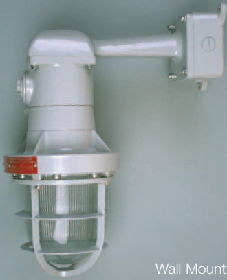
Wall Mount (-W)