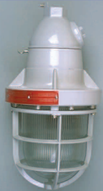
Pendant Mount (-P)