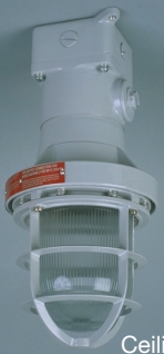
Ceiling Mount (-C)