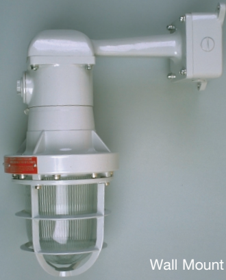
Wall Mount (-W)