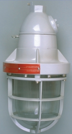
Pendant Mount (-P)