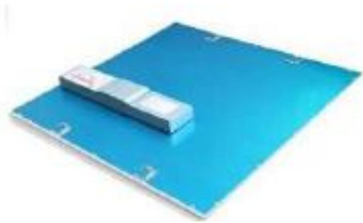
Emergency battery back up